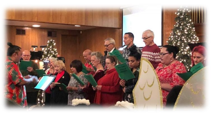
LOVE CAME DOWN AT CHRISTMAS Love came down at Christmas, Love all lovely, Love divine; Love was born at Christmas; star and angels gave the sign.